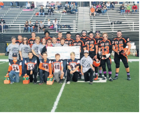
Giving Back! WE WANT TO BEAT CANCER! It affects the lives of our friends and families. Thank you for fighting