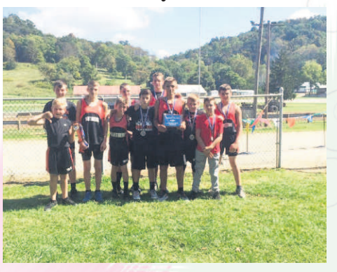
NLMS runners prepare for the run.